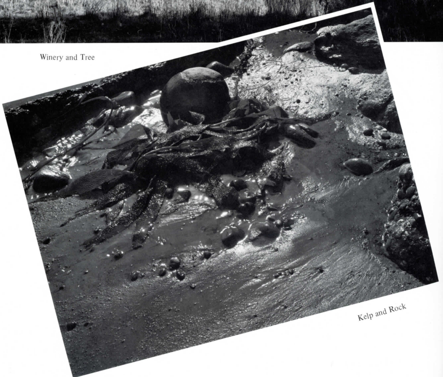
Kelp and Rock